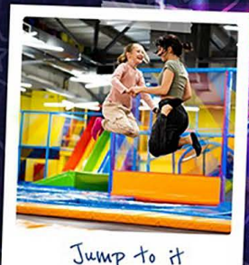
Jump to it